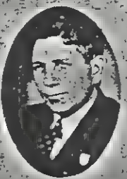
J. H. Hammack Retail Schools